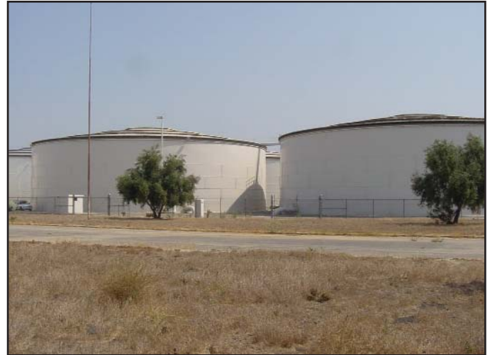
Alamitos Tank Farm

During fiscal year 2005, the Long Beach Water Department's groundwater treatment plant processed more than 7 billion gallons of drinking water. In addition, more than 21 billion gallons of drinking water were delivered to the Long Beach community. With an eye toward the future, LBWD plans to implement Wonderware's solutions to support new programs and create greater efficiencies throughout the department as it responds to the ever-increasing water needs of the city. With its technology solutions well in hand, Long Beach is destined to become one of the most effective, efficient and competitive municipally run water departments in California.